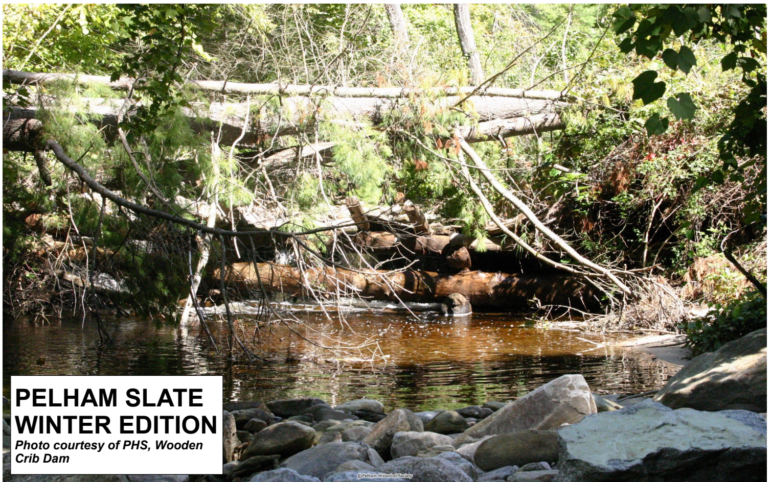
Wooden Crib Dam

PRESORTED STANDARD MAIL U.S. POSTAGE PAID AMHERST, MA PERMIT NO. 31