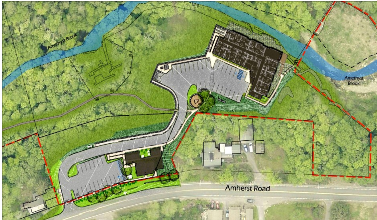
20-22 Amherst Rd Overhead Drawing