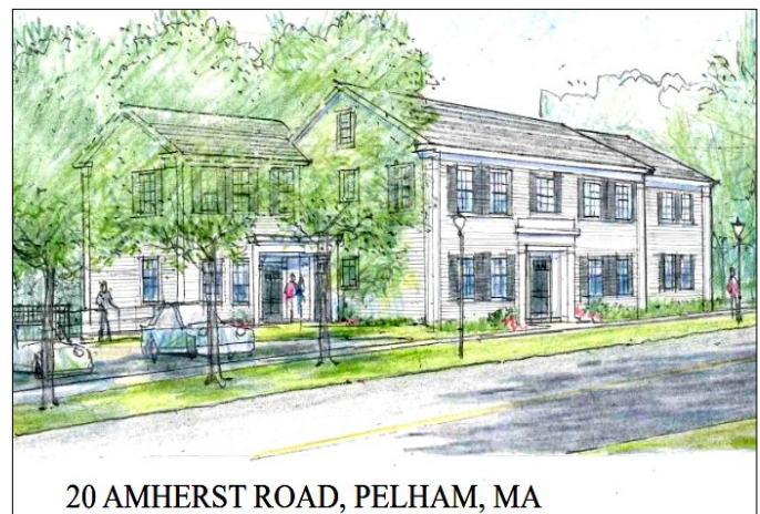
20 AMHERST ROAD, PELHAM, MA

Western Builders, the construction contractors, are just beginning site work. The new two-story building at 20 Amherst Rd. (site of the former Peterson property) will have six apartments, and the new three-story building at 22 Amherst Rd., (where HRD Press was located), will have 28 apartments, and a small community room. Overall, there will be a total of 24 one-bedroom apartments, 7 two-bedroom apartments and 3 three-bedroom apartments. In the coming months we plan to have a display in the library with more details, including layouts and floorplans. Meanwhile, please continue to read updates in the Pelham Slate .